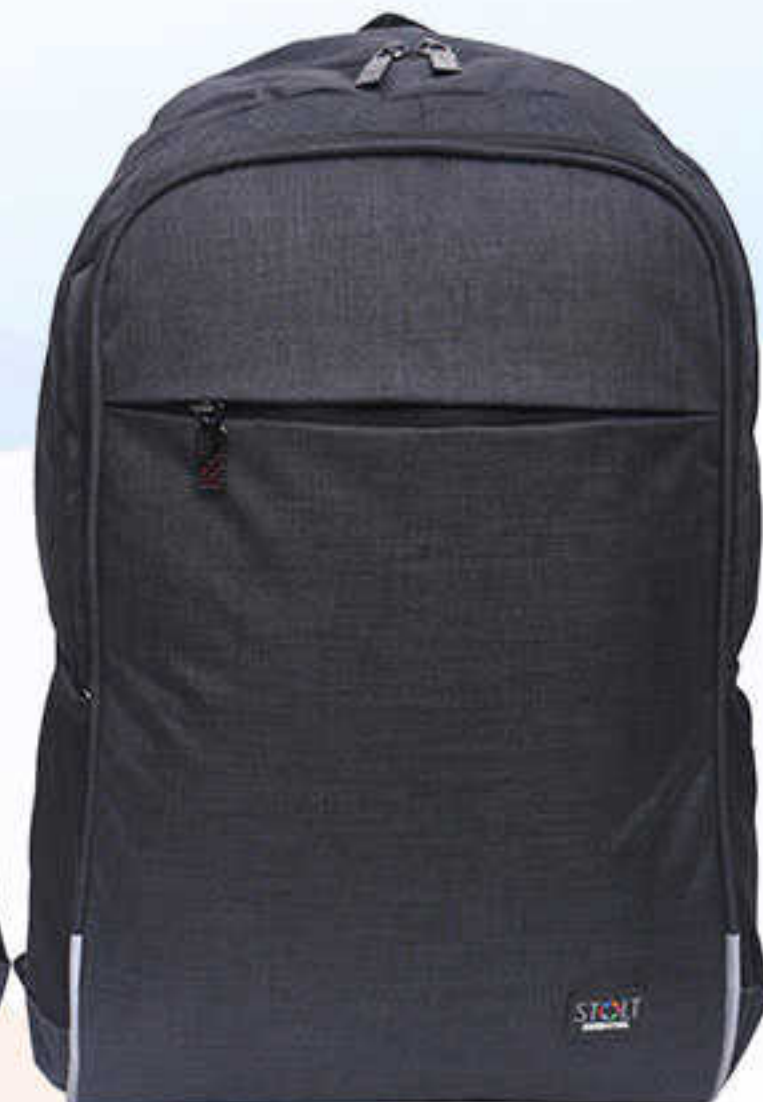
■ SBEZ-01A-BK-C CHARCOAL BLACK