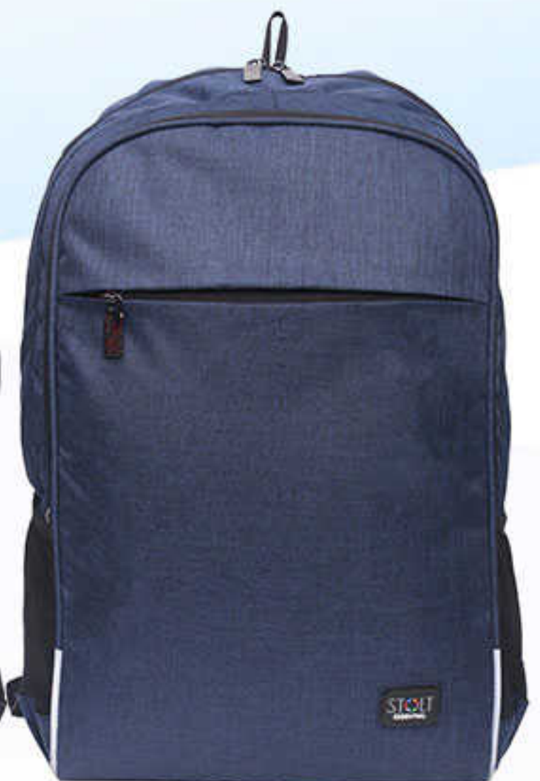
■ SBEZ-01A-BL-C ROYAL BLUE