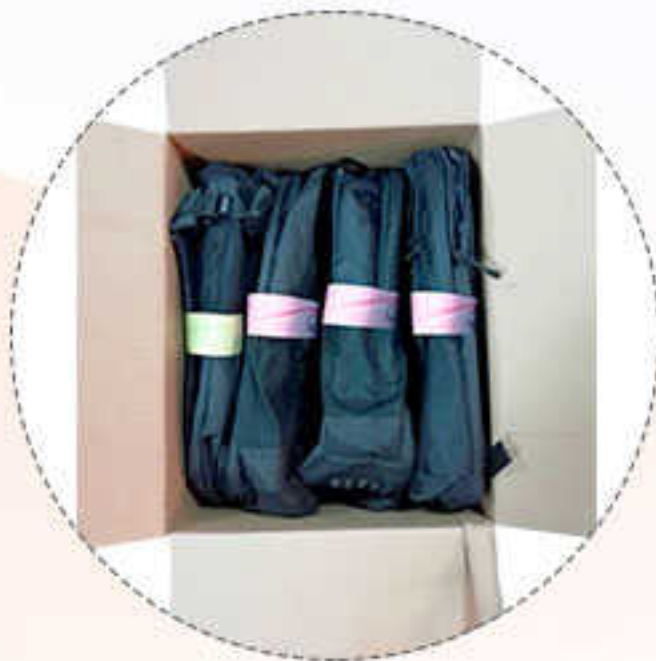
5 backpacks will be packed in one carton box