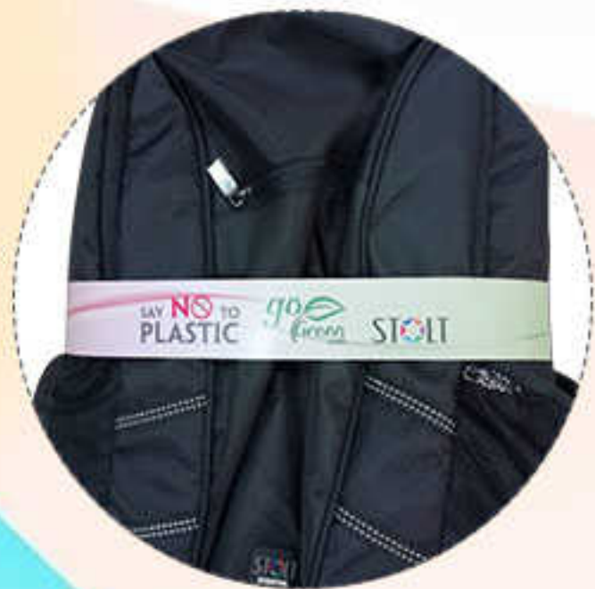
Every bag will have SAY NO TO PLASTIC tag