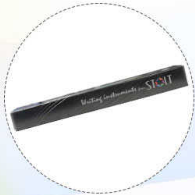
Every pen will come with paper box