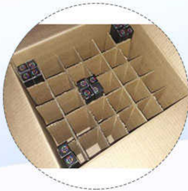
50 pens will be in one carton box