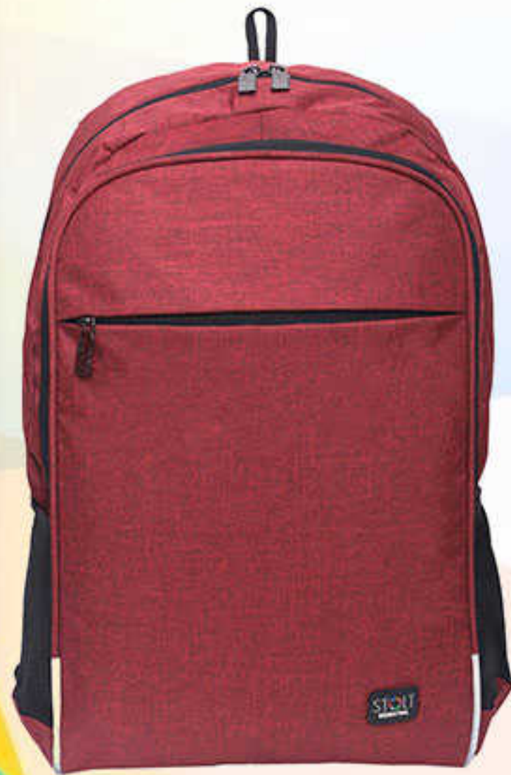
■ SBEZ-01A-RD-C FANCY RED