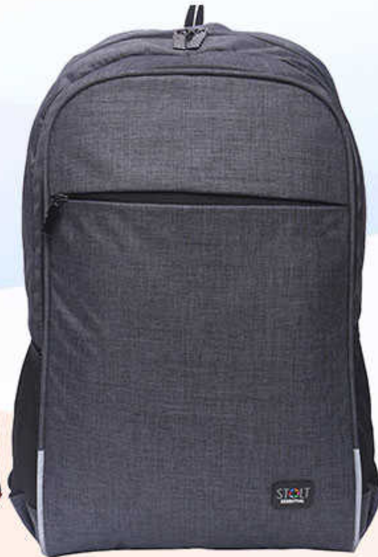
■ SBEZ-01A-GY-C CARBON GRAY